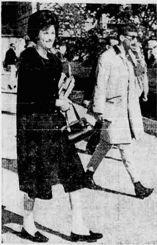
WALKS TO CLASS — Lynda Bird Johnson, daughter of President and Mrs. Lyndon B. Johnson, walks to her Latin class in Austin, Tex. She is attending the University of Texas. Lynda, who is the oldest daughter of President and Mrs. Johnson, will continue her schooling in Texas at least until January 1964 when she may change schools.