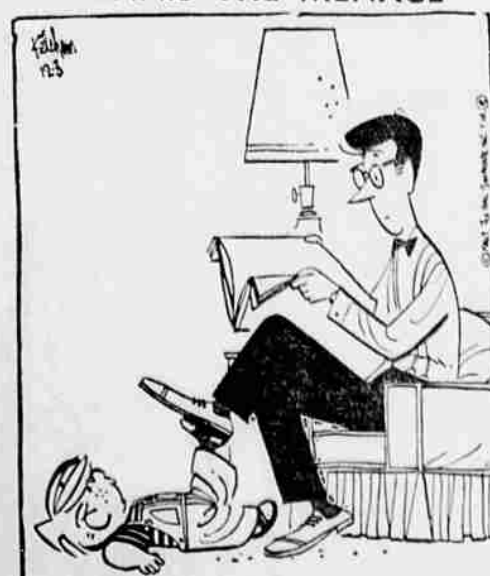
*YOU GURE GOT A LOTTA FEET!