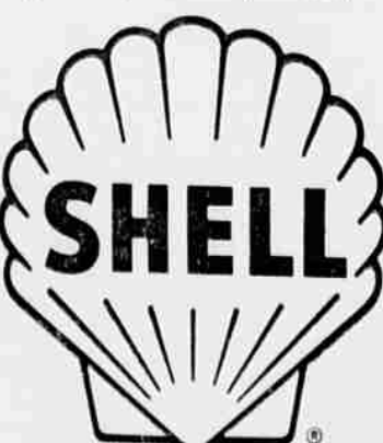
Drive in where you see this sign— for good service, honest work, fair prices

FACT: Gasolines actually differ in many ways. In weight, for instance. One