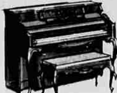
KIMBALL Fontainebleau PIANO. 10 year warranty.