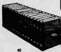
40 "OUR WONDERFUL WORLD" LIBRARIES. 18 volume sets.