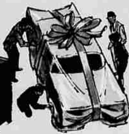
2 FORD SEDANS. Latest models