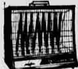
80 ATLAS-AIRE electric HEATERS. Fast heating. Safety switch. Thermostat.