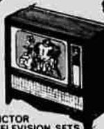
3 RCA-VICTOR COLOR TELEVISION SETS