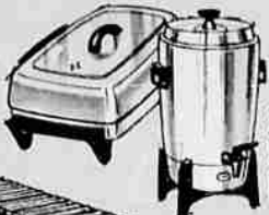
Famous WEST BEND APPLIANCES. Hostess Sets. 10 to 30 cup percolators, toasters, griddles, Buffet Chafers, etc. (405 prizes)