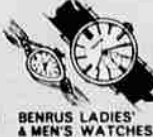
BENRUS LADIES' & MEN'S WATCHES & PAIRS. 17 jewels. 14K gold cases. Guaranteed 3 years. (30 prizes)