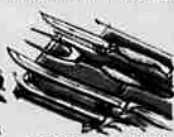
CARVEL HALL SETS. Stainless steel carvers, forks, slicers, steak knives. (1110 prizes)