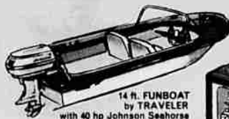
14 ft. FUNBOAT by TRAVELER with 40 hp Johnson Seahorse