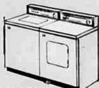
SPEED QUEEN WASHERS & DRYERS & PAIRS. Automatic. All latest features. (48 prizes)