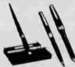
SHEAFFER'S PEN & PENCIL SETS. 14K gold inlaid points. (400 prizes)