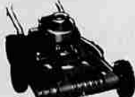
70 ATLAS-AIRE POWER MOWERS. Rotary. Choke-A-Matic controls.