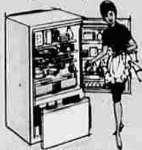
3 GENERAL ELECTRIC 2-Door Frostfree REFRIGERATOR-FREEZERS