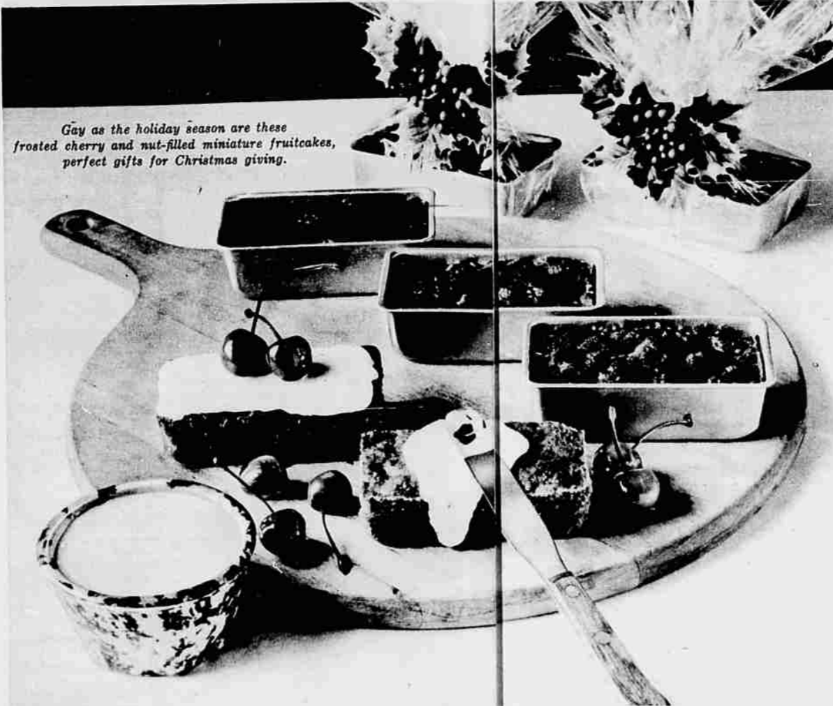
Gay as the holiday season are these frosted cherry and nut-filled miniature fruitcakes, perfect gifts for Christmas giving.

at housewares, hardware, gift and appliance stores THE WEST BEND COMPANY Dept. 86C West Bend, Wisconsin