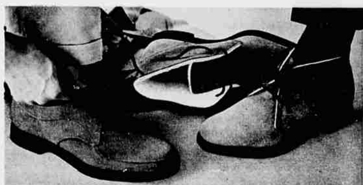
OR THEIR LIGHTWEIGHT COMFORT . . .