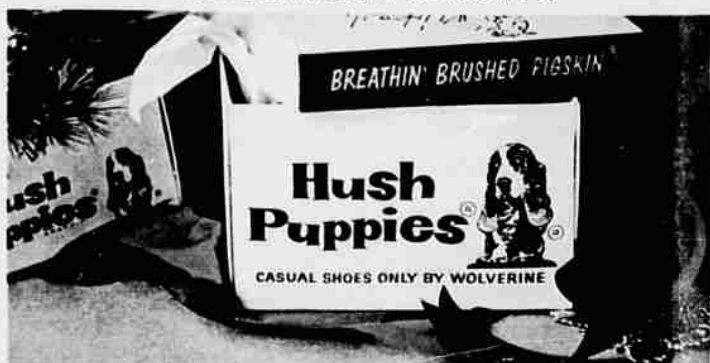
YES . . . (AND A MERRY CHRISTMAS TO ALL).

Over 100 styles and colors available, from youngsters' size 10 (6.95 to 8.95) to women's size 11 and men's size 16 (8.95 to 10.95) / Golf and specialty shoes about 12.00 to 14.00 — at fine stores everywhere.