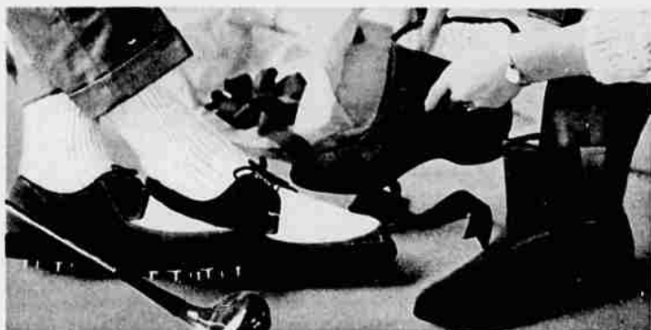
OR THEIR RESISTANCE TO SOILING AND STAINING?