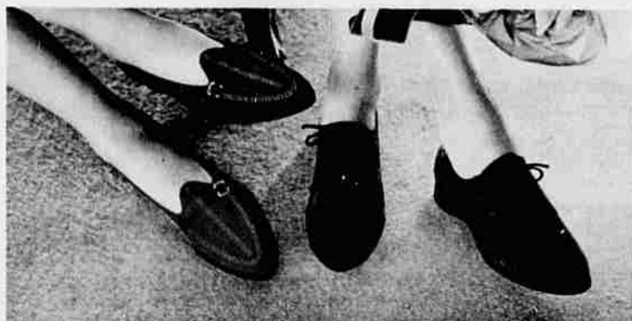
OR THEIR SOFT BRUSH-CLEAN PIGSKIN . . .