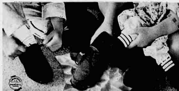
IS IT THEIR STEEL SHANK SUPPORT . . .