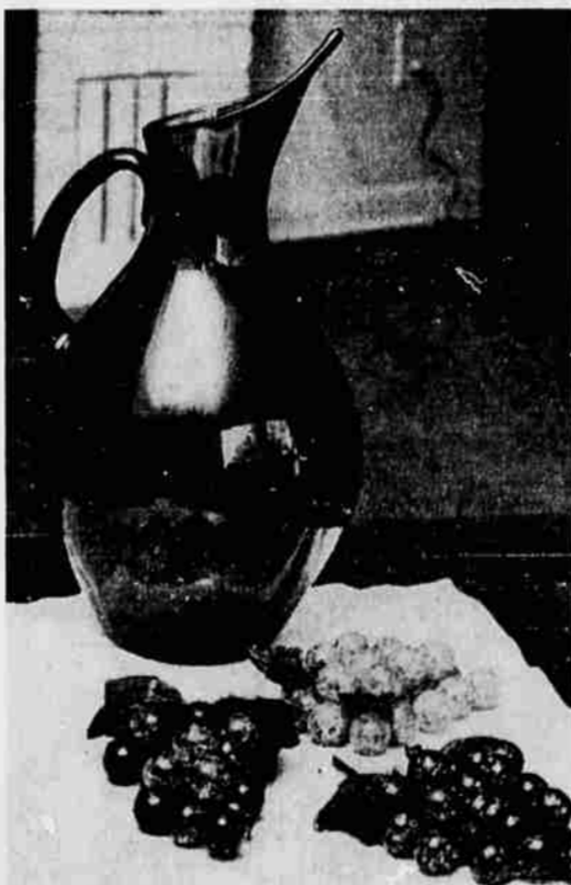
"Fried" marbles made into clusters of beautiful artificial grapes will be on sale at the Providence Guild bazaar December 6 at Sacred Heart Hospital.