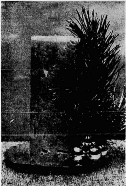
Mrs. Henry Grossman achieved a different texture in a Christmas candle by putting ice cubes in the hot wax as she poured it into the mold. This blue candle arrangement, displayed at the Central Point Garden Club show, stands on a silver plate and is completed with silver Christmas tree balls at the base of an evergreen sprig.