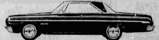
DODGE POLARA 500 2-DOOR HARDTOP

Why not stop by your Dodge showroom soon? You'll see all types of Dodge Boys... and a great line of Dodges, too: Like this striking Polara 500 2-door Hardtop with beautiful new console. You might even want to take one home. A car, that is.