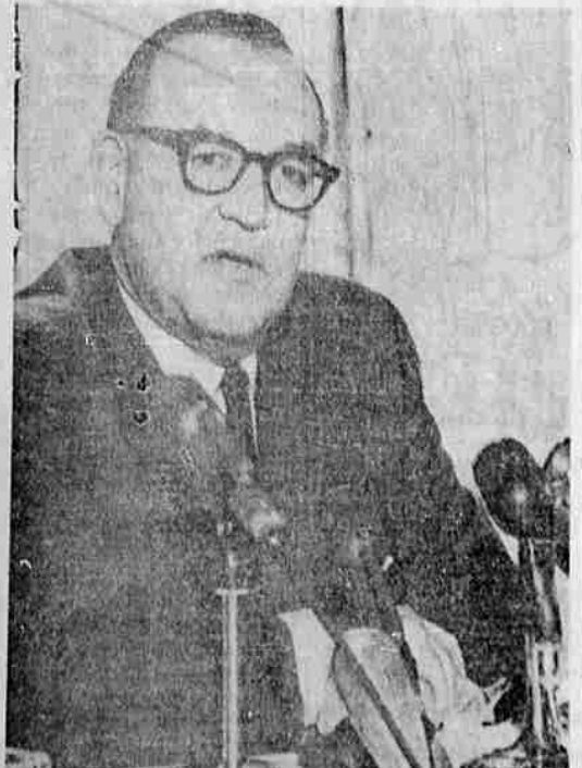
BROWN RETURNS — California Gov. Edmund G. Brown, in a press conference at Los Angeles following his return from Washington where he attended the funeral for the late President Kennedy, said he hoped the President's assassination would have a "cleansing effect" in the fight against all extremists. Brown added that he got the impression that Alabama's Gov. George Wallace, a segregationist leader, would like to re-examine some of the things that he's been doing.