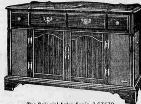
The Colonial Astro-Sonic, 3-ST672 in Cherry or Maple. Also in decorative Green, $525.

Powerful combined Stereo Amplifier and Radio Chassis—has no tubes, produces 30-watts undistorted music power. Though ten times as efficient as a comparable tube set, it uses no more current than a small light bulb.