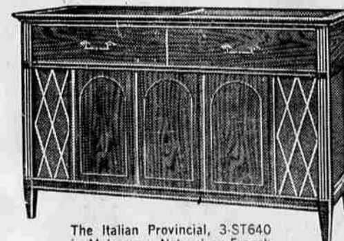
The Italian Provincial, 3-ST640 in Mahogany, Natural or French Walnut. Also in Antique Green, $525.

Two 1000 cycle Exponential Treble Horns—have the acoustical efficiency of 20 cone speakers. They re-create pure, distortion-free treble tones—even from percussion instruments.