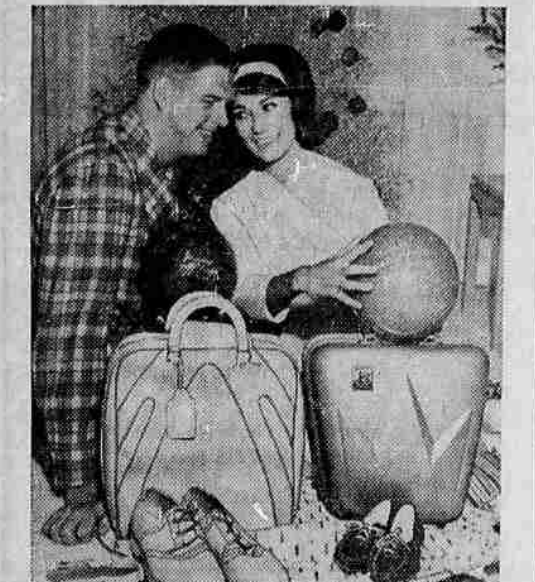
MATCHED EQUIPMENT —His and hers: Color matched bowling equipment and accessories include ball, bag and shoes. Each may be purchased separately, or there is a female ensemble and a male ensemble. Whatever the choice, color-coordinated bowling equipment is sure to score at Christmas! By Brunswick Corporation.