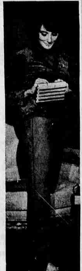
COSTUME — A gifted pair — the tapered slacks with coordinated pullover! The slacks feature a contour waistband and hidden side zipper. The topping is a velvet overblouse with a detachable dickey. By Wardrobe Maker.