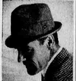
TOP GIFT FOR HIM — It's the newest on the hat scene, a genuine sueded leather hat with self band and all-over stitched brim. It's a man's first choice for casual affairs. By Dobbs

*If crystal, stem and back are intact *Ask about Weisfield's famous "drop-it, wet-it, smash-it" one-year watch guarantee. THE WEST'S LEADING CREDIT JEWELERS WEISFIELD'S Open Week Days Until 9 p.m. Medford Shopping Center Acres of Free Parking Phone 772-5348