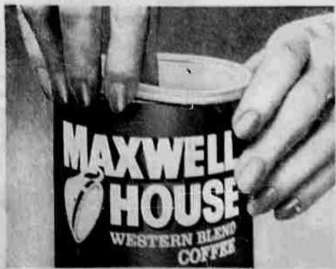
1 Clear, plastic "Flavor-Tight Top" lifts off quickly and easily. Has no sharp edges to nick your fingers.

4 important facts about the new no-key can with the "Flavor-Tight Top"—from Maxwell House Western Blend