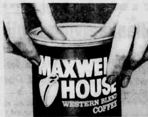
3 "Flavor-Tight Top" snaps back on—helps keep that good-to-the-last-drop flavor fresh every scoopful.