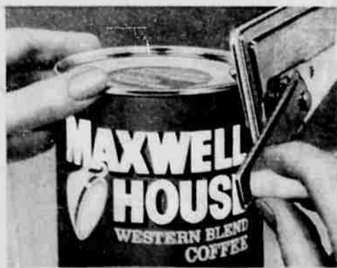
2 No key to struggle with! Just once around on your can opener breaks the vacuum seal, opens the can.