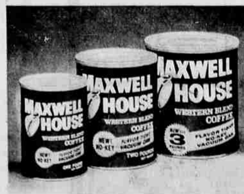
4 Now in 3 sizes! Slender new one-pound can, familiar two-pound can and convenient new three-pound size.