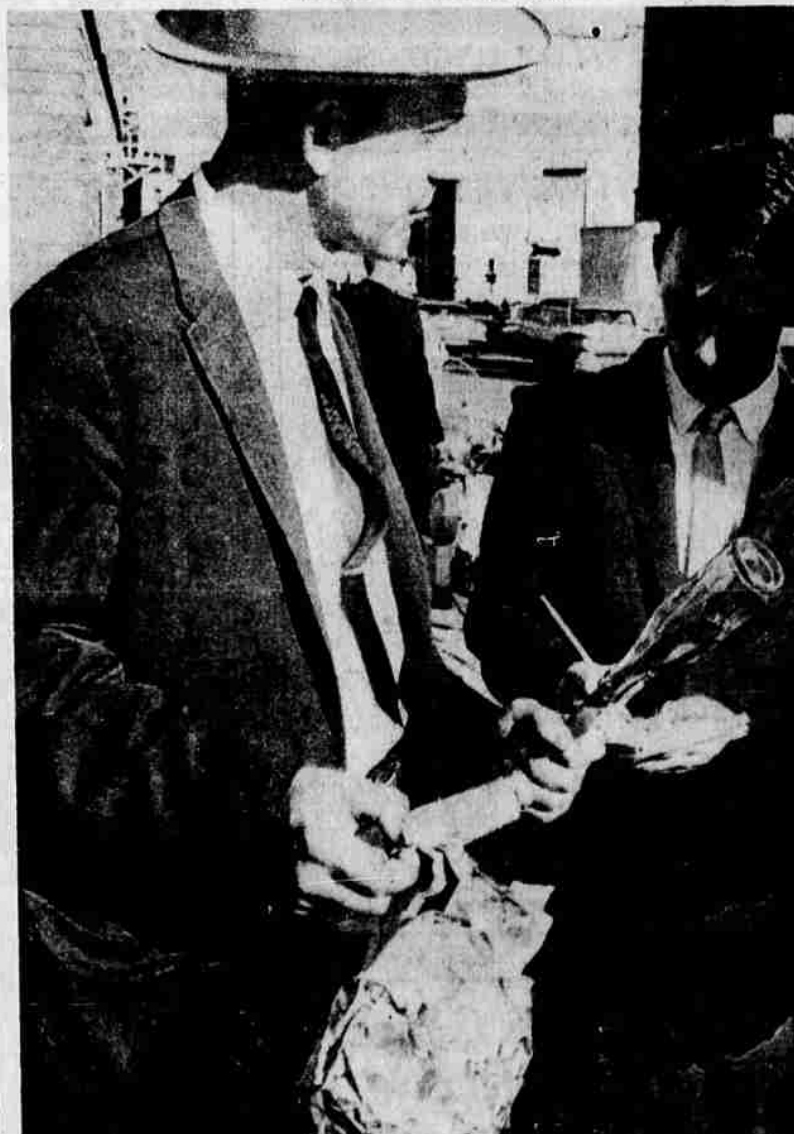
A member of the Dallas Crime Lab holds a lunch sack and drink bottle which were found at the sniper's hideout. The killer apparently ate his lunch while waiting for the President's motorcade.