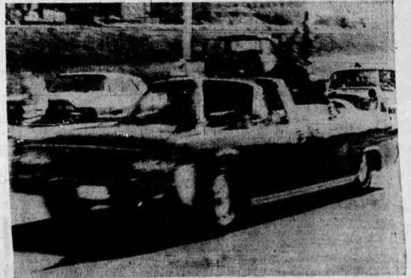
The President's car, carrying the wounded President John F. Kennedy speeds toward Parkland Hospital.