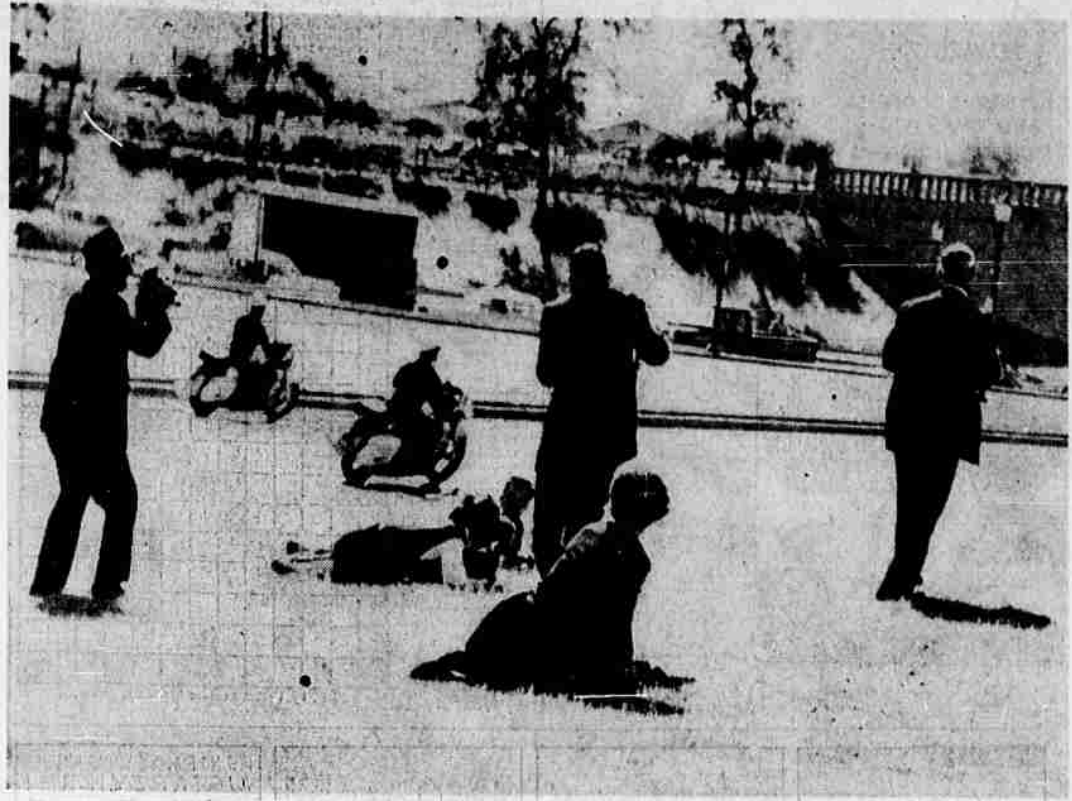
Spectators hug the ground as newsreel cameramen take pictures as the President is rushed to Parkland Hospital critically wounded in Dallas, Tex.

DALLAS — Here is a chronological breakdown of the final minutes of President Kennedy's life. Some times are approximate