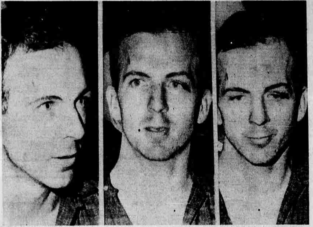
Lee Harvey Oswald, 24, a former Marine and self-styled communist who once renounced his American citizenship and unsuccessfully sought to become a Soviet citizen, was charged with the murder of President John F. Kennedy. Oswald is shown here at the Dallas Police Station where he is being held. He also is charged with the murder of a Dallas policeman who he allegedly shot when the officer attempted to question him.