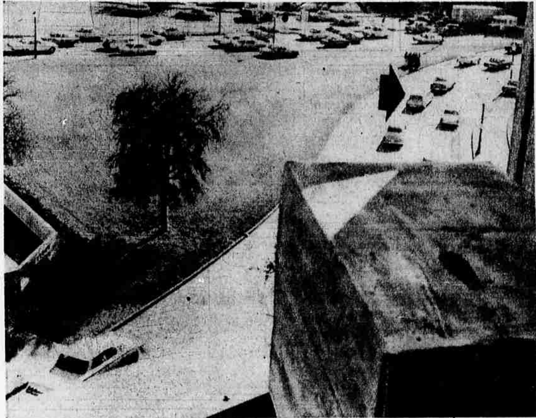
This window is the spot from which a sniper assassinated President Kennedy and injured Texas Gov. John Connally. The President's car was in the upper right-hand corner (arrow).