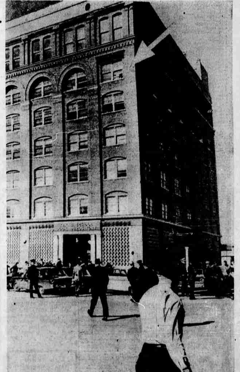
The arrow in this picture points to window where assassin shot the President of the United States, John F. Kennedy, in Dallas, Tex., Friday.