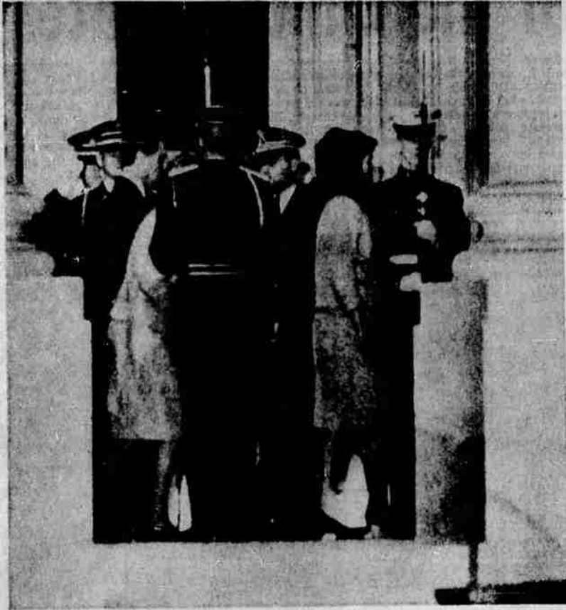
Mrs. Jacqueline Kennedy, still wearing the same blood-stained suit and stockings, follows casket bearing her husband's body into the White House. She was accompanied by the slain President's brother, Atty. Gen. Robert F. Kennedy.