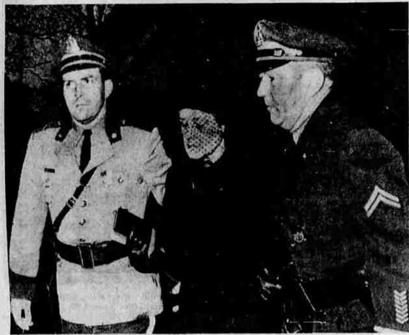
Mrs. Rose Kennedy, mother of the slain President, is shown on her way to 7 o'clock Mass at St. Francis Xavier Church Saturday morning at Hyannis, Mass. She is escorted by two state troopers.