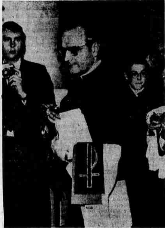
A Roman Catholic priest, from St. Matthews Cathedral, carrying holy vestments, is followed by an altar boy as they arrive at the White House Friday night. Two priests stood vigil over President Kennedy's coffin through the night.