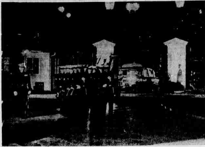
A military honor guard marches in front of the ambulance bearing the casket of the late Pres. John F. Kennedy as it was returned to the White House early Saturday. The casket was taken to the East Room of the Executive Mansion where it lay in repose Saturday.