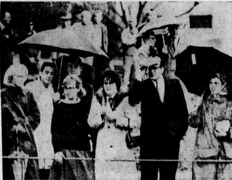
People brave heavy rain Saturday to stand outside the White House. The President's body lay inside in a casket draped with an American flag as the United States and the world mourned.