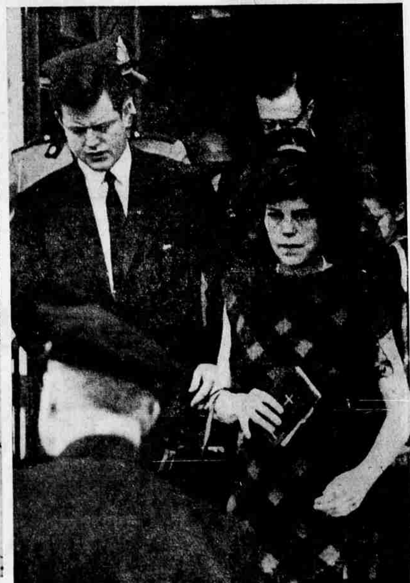
Sen. Edward M. 'Ted' Kennedy and his sister, Eunice Shriver, as they left St. Francis Xavier Church in Hyannis, Mass., Saturday, following Mass for the late President.