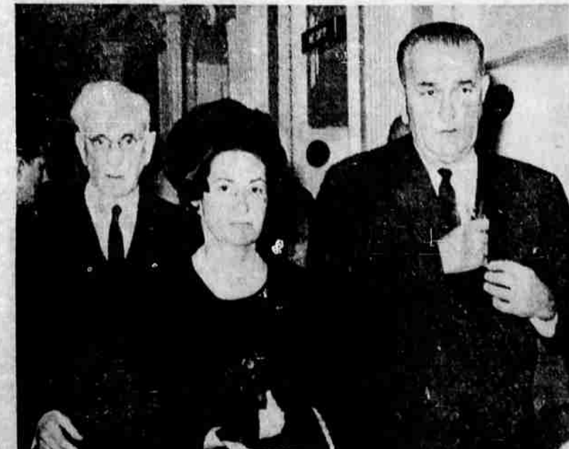
Speaker of the House John McCormack (L), who is now first in line of succession to the Presidency, accompanies President Lyndon B. Johnson and Mrs. Johnson to the White House Saturday to pay respects to the late President Kennedy.