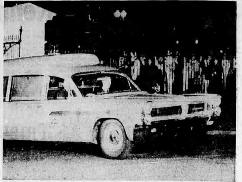
U.S. Navy ambulance carries the body of the late President past people lined up along the fence and through the White House gate early Saturday. Mrs. Jacqueline Kennedy, wife of the slain President, accompanies him on his final return to the Executive Mansion. She's seated just behind the driver.