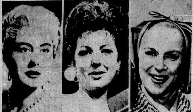
BEAUTY AND VOICE — Representing operatic femininity at its eye-pleasing best, Metropolitan Opera prima donnas (L-R) Lisa Della Casa, Anna Moffo, and Mary Costa are lovely to look at as well as to listen to, New Yorkers maintain.