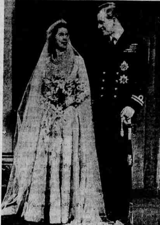
WEDDING ANNIVERSARY — Wednesday was the 16th anniversary of the day in 1947 that a very shy but radiantly happy Princess Elizabeth was married in Westminster Abbey to the naval lieutenant she loved. He was Philip Mountbatten, born a Greek prince, now a naturalized British citizen and just on the wedding eve created Duke of Edinburgh. There was no public fuss over the anniversary for the now ruling British monarch, Queen Elizabeth and her husband Prince Philip. They are shown in a formal portrait on their wedding day.

Royal Canadian Mounted Police said a man would be able to walk in the snow for only a short time before he became exhausted.