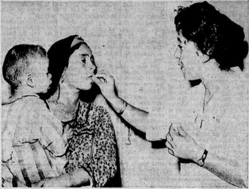
TAKES BIRTH CONTROL PILL — To curb Egypt's population boom, President Gamal Abdel Nasser last year took a step unprecedented for a modern Moslem chief of state by advocating birth control. In this photo a village woman is shown taking a pill during the birth control campaign.

In 1932 there were 17 million Egyptians. Last year the esti-