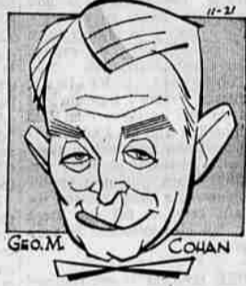
GEORGE M. COHAN

© 1963, by Bennett Cerf. Distributed by King Features Syndicate