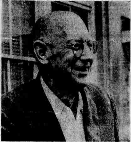
ROBERT STROUD Dies of Natural Causes

Nitze, now an assistant secretary of defense, will succeed Fred Korth who resigned Nov. 1.