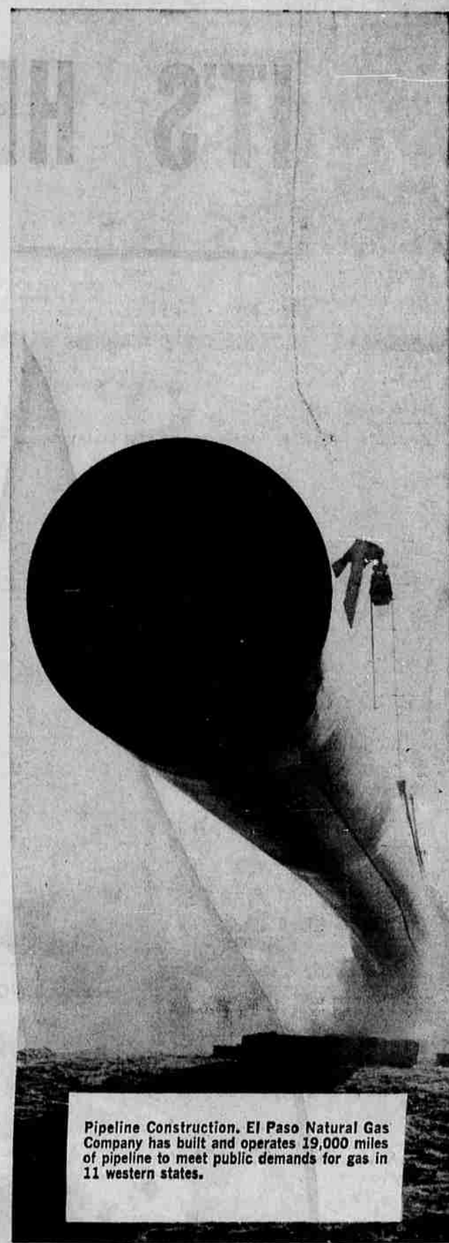
Pipeline Construction. El Paso Natural Gas Company has built and operates 19,000 miles of pipeline to meet public demands for gas in 11 western states.