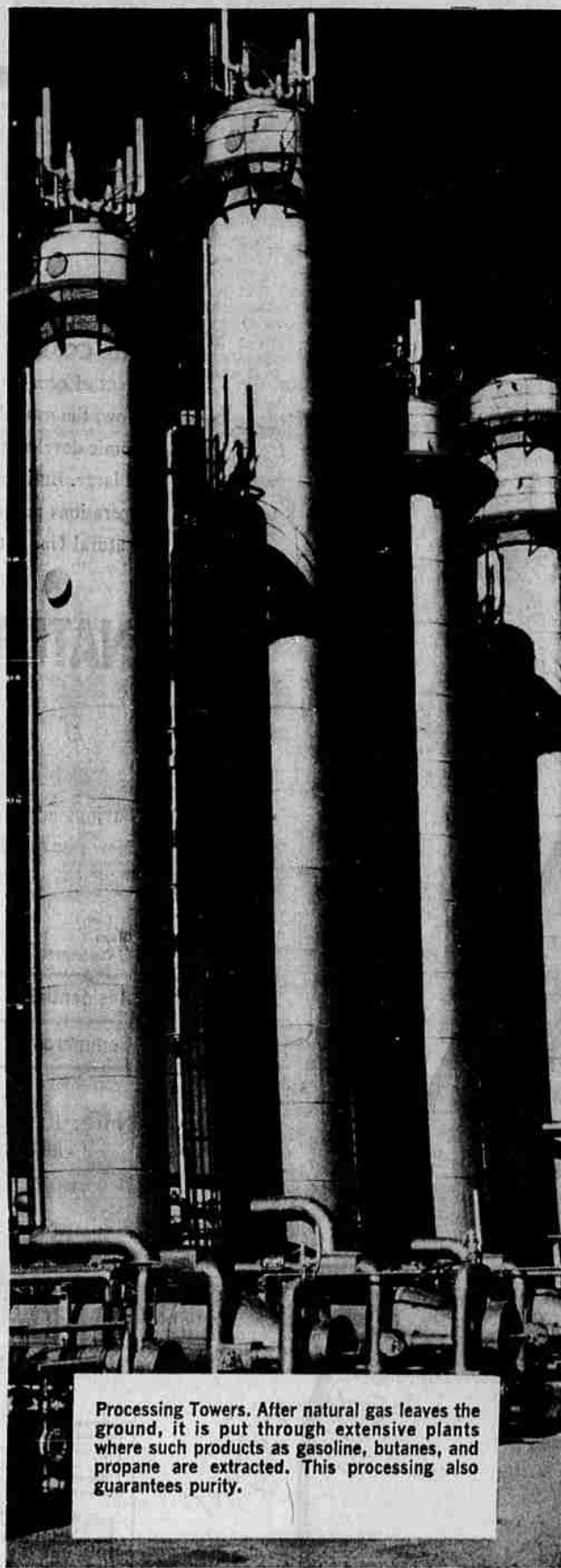
Processing Towers. After natural gas leaves the ground, it is put through extensive plants where such products as gasoline, butanes, and propane are extracted. This processing also guarantees purity.