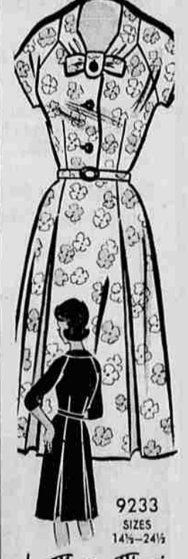
9233 SIZES 14 1/2-24 1/2 by Marian Martin

Never underestimate the charm of a bow—especially when it points up a neckline as pretty as this. Note graceful, inverted-pleat skirt. Printed Pattern 9233: Half Sizes 14 1/2-16 1/2, 18 1/2, 20 1/2, 22 1/2, 24 1/2. Size 16 1/2 requires 3 1/2 yards 45-inch fabric. FIFTY CENTS in coins for this pattern—add 15 cents for each pattern for first-class mailing and special handling. Send to Marian Martin, Medford Mail Tribune, Pattern Dept., 232 West 18th St., New York 11, N.Y. Print plainly NAME, ADDRESS with SIZE and STYLE NUMBER. CLIP COUPON FOR 50c FREE PATTERN in big, new Fall-Winter Pattern Catalog, just out! 354 design ideas. Send 50c for Catalog.