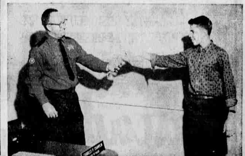
Two minutes later: Here are your cuffs back.