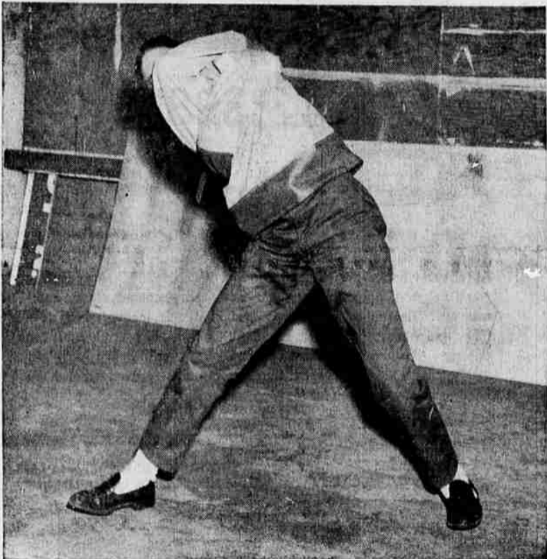
If I can just get my arm over my head.