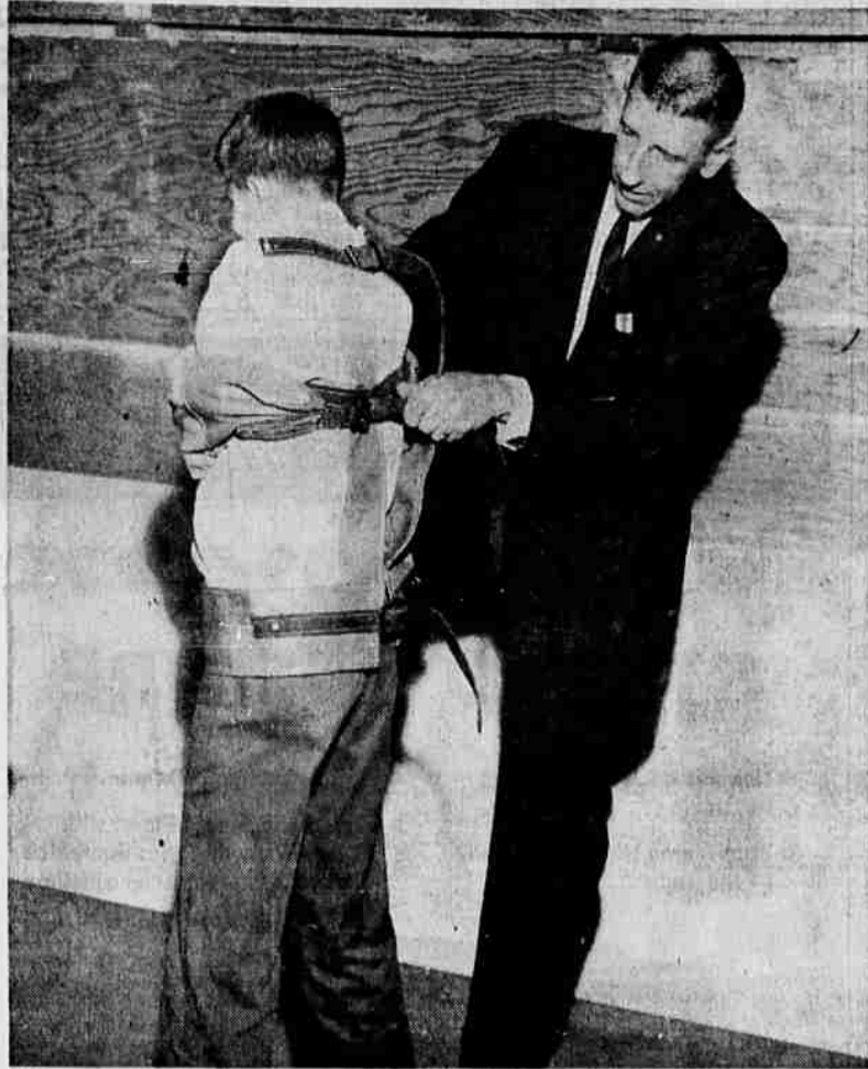
I want to pull this one notch tighter.

SECTION B MEDFORD, OREGON, SUNDAY, NOVEMBER 17, 1963 PAGES 1 to 8