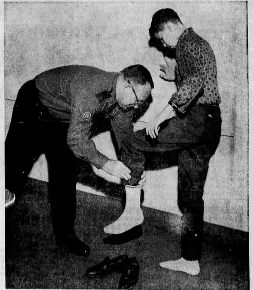
Hold your leg up here so I can frisk you.