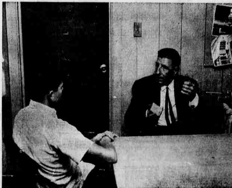
Back in the office: How are you at card tricks?