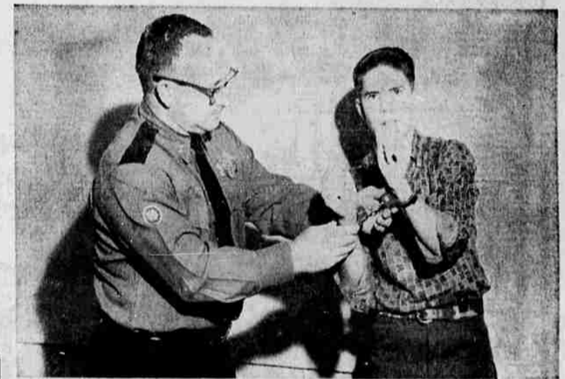
Click! There, that ought to hold you.