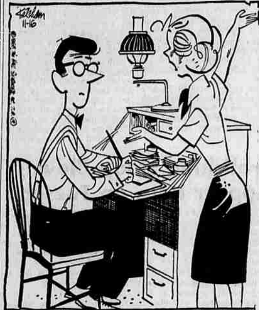
"DID YOU HAVE TO SAY WE WERE GOING TO THE POOR FARM? HE'S UPSTAIRS PACKING!"