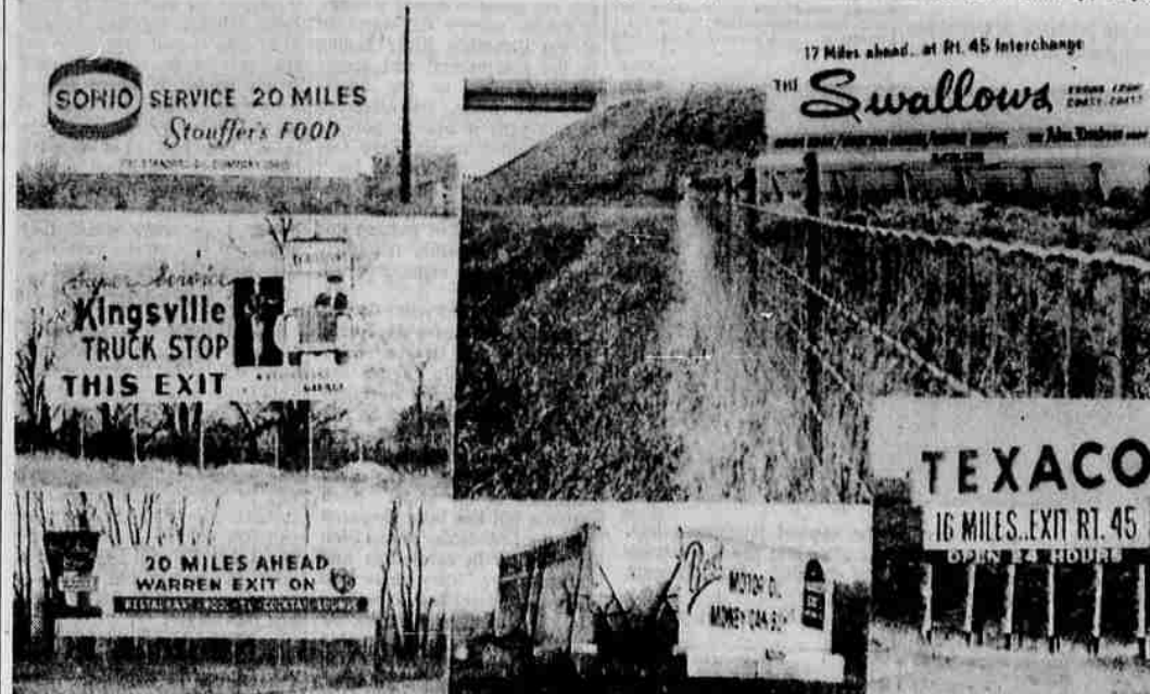
INTERSTATE BILLBOARDS—Billboard row along Interstate 90 in Ashtabula County, Ohio, includes these signs which the State Highway Department considers illegal because they are within 600 feet of the right-of-way fence.