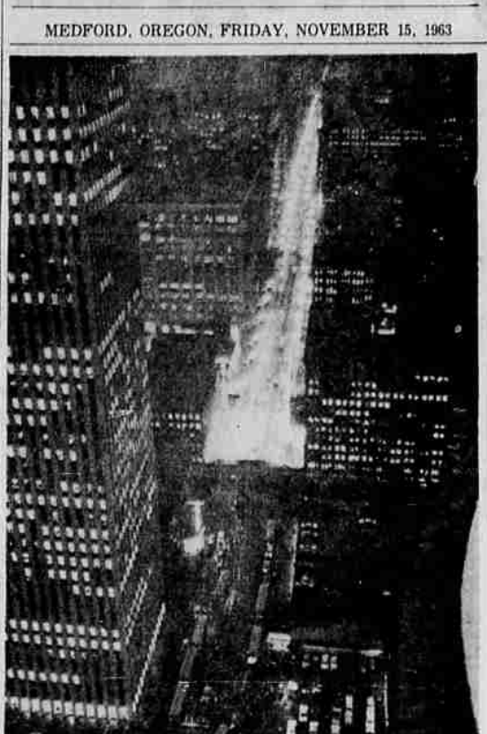
STATE STREET—This is a view of State Street in Chicago at night, as seen from the observation roof of Marina City's east tower, some 60 floors high. The photo was made in natural light and is not a time exposure.

Commented dealer Radan: "The machine had a run of luck."