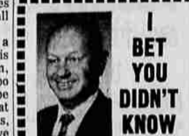
by Paul Lea

Southwest: Deer are beginning to appear at lower elevations but elk remain holed up at higher elevations. Pheasant hunting has been poor to fair.