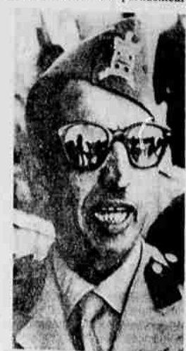
SMALL BUT FIERCE — Brig. Hassan El Amry, who is the pocket-sized but fierce vice president of Yemen, is shown here in a 1963 photo (UPI)

By DAVID BISHAI United Press International SANA'A, Yemen (UPI) — The man who runs war-torn Yemen today is its small (5 feet, two inches), fierce and paradoxical