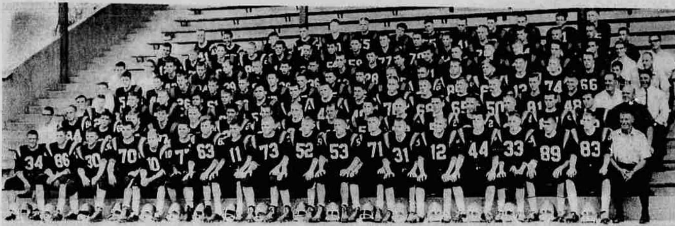
CHAMPS OF CONFERENCE — Medford High's Southern Oregon Conference football championship squad is pictured above. The Black Tornado, which is also defending state champ in Class A-1, will carry its title defense another

step this Friday night when it goes to Roseburg. This will be an Oregon quarterfinal playoff game.