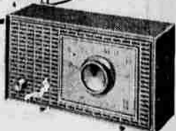
Model A71, Antique White or Beige