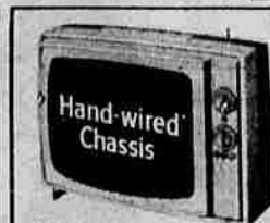
MODEL 19P35 19" overall diagonal measure; 172 sq. in. picture viewing area. Desert Sand color.