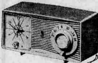
Model X-34, Blue or Black