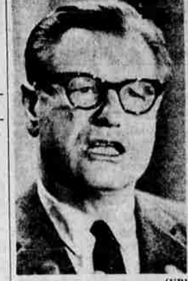
NELSON ROCKEFELLER Doing Spade Work

It was apparent that several other alternate plans, many built around either a cigarette or sales tax, would be unveiled within the next few days.