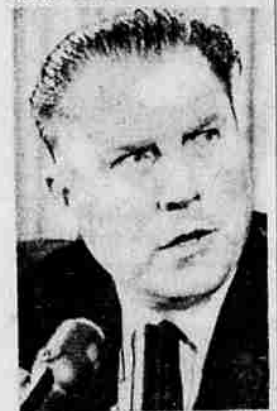
JAMES HOFFA Not Unrealistic

WASHINGTON —Teamsters' President James R. Hoffa expressed confidence today that his union would win most of the $600 million worth of wage-benefit increases it seeks from the trucking industry in a new nationwide contract.