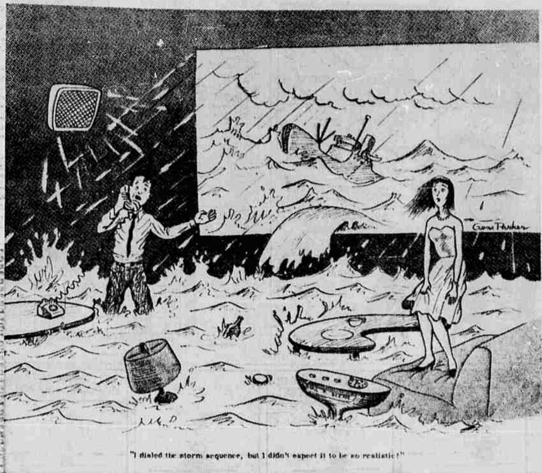
NEW CONCEPT—"Total Environment," a new technically feasible concept of "dialing" environmental moods right into the living room, may be available some day soon, even in the