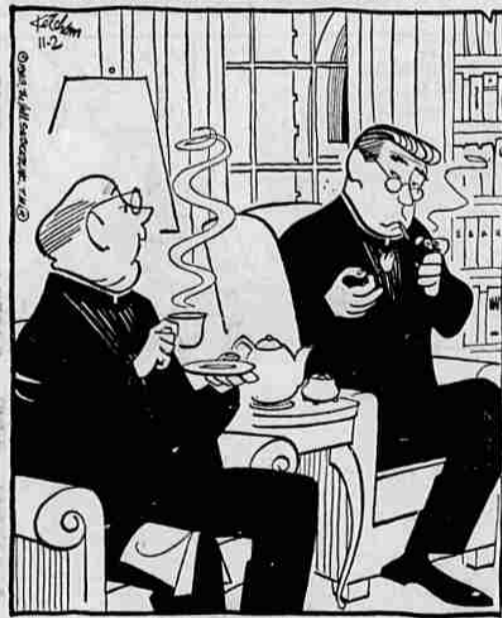
YOU KNOW WHAT HE SAID TODAY? HE ASKED ME IF HE COULD RING THE BELLS SOMETIME!