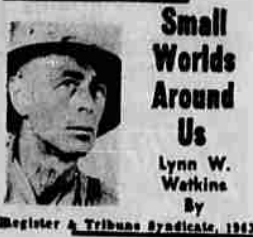
Small Worlds Around Us Lynn W. Watkins By Register & Tribune Syndicate, 1963

—$35 million for new Nike-Hercules and Hawk missile batteries and other air defense facilities in the southeastern part of the United States. These facilities highlighted the new emphasis being placed on defense from a possible air attack from Communist Cuba.