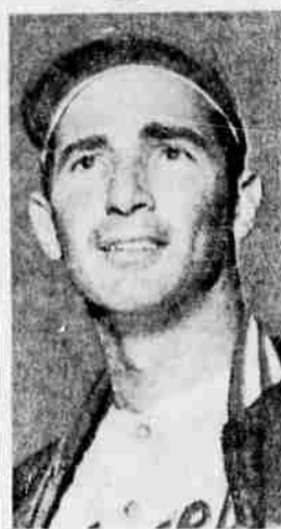
SANDY KOUFAX MVP in National

his smoking side when Nicklaus holes a 75 foot trap shot and rushes up to congratulate the kid from Ohio for "the greatest shot I've ever seen."