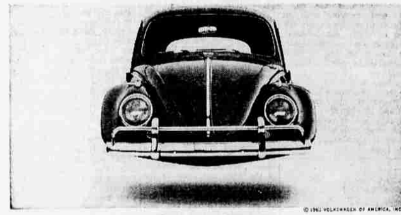
This we don't.

Now you can see for yourself where we make most of our changes. Way down deep. Every part you can see (and every part you can't see) has been changed again and again and again. But we never change the Volkswagen without a reason. And the only reason is to make it even better. When we do make a change, we try to make the new part fit older models, too. So you'll find that many VW parts are interchangeable from one year to the next. Which is why it's actually easier to get parts for a VW than for many domestic cars. And why VW service is as good as it is! The same principle holds good for the beetle shape. We made the rear window bigger one year so you could see other people better. We made the tail lights bigger last year so other people could see you better. But nothing drastic. Any Volkswagen hood still fits any VW ever made. So does any fender. And, in case you hadn't noticed, every VW still looks like every other VW. Which may turn out to be the nicest thing of all about the car. It doesn't go in one year and out the other.