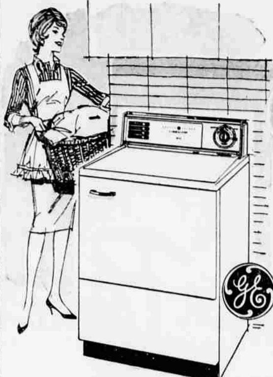
HIGH SPEED DRYER Model 615X