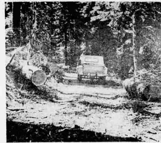
STORM DAMAGE — This picture shows an example of the Columbus Day, 1962, storm blowdown. This condition during the past summer posed a serious threat to the forest from the fire aspect, and unless cleaned up within a reasonable length of time poses a threat of insect infestation. Much of the blowdown, however, has been cleaned up in this area.

DENVER (UPI)—Gov. Nelson Rockefeller of New York said Tuesday he would continue to press Sen. Barry Goldwater, (R-Ariz.), for a debate in advance of the 1964 Republican National Convention.