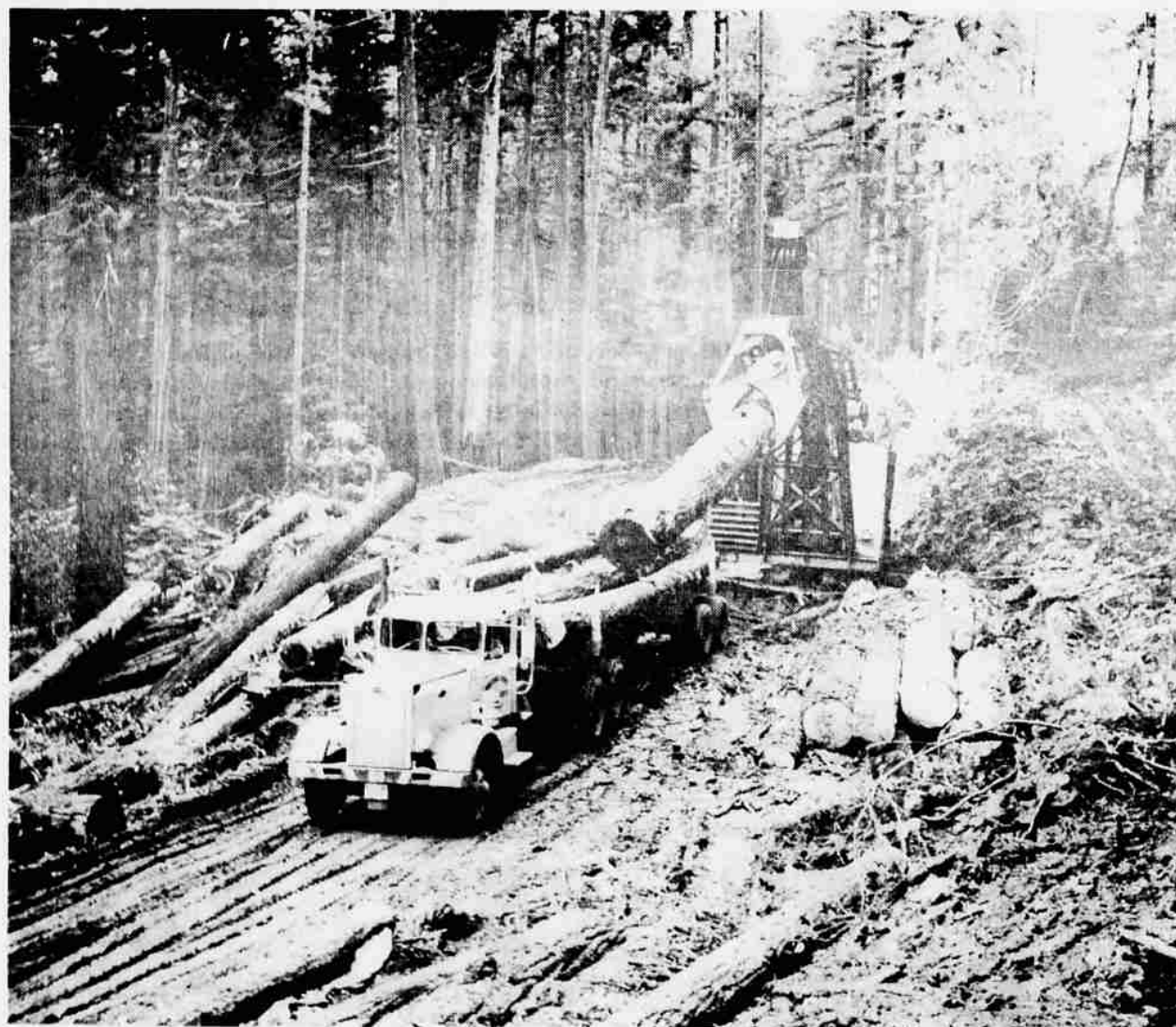
Photo of Medco Logging Operation

... you profit twice. Beauty, economy, versatility, plus support of local industry to insure local payrolls.