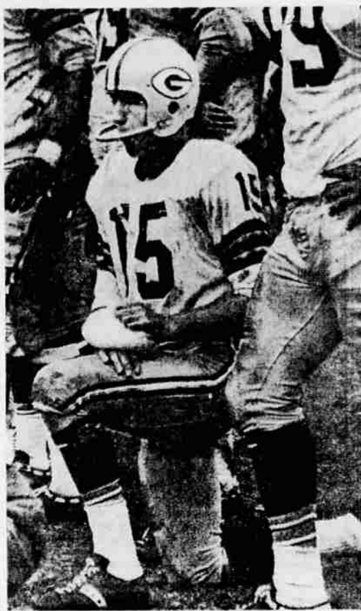
AFTER INJURY—Packer quarterback Bart Starr (15) sits dejectedly on the bench after he injured his throwing hand in the game at St. Louis Sunday.

By United Press International The college football season took a heavy toll of hopefuls today, with only 35 survivors listed as unbeaten and untied at the halfway mark.