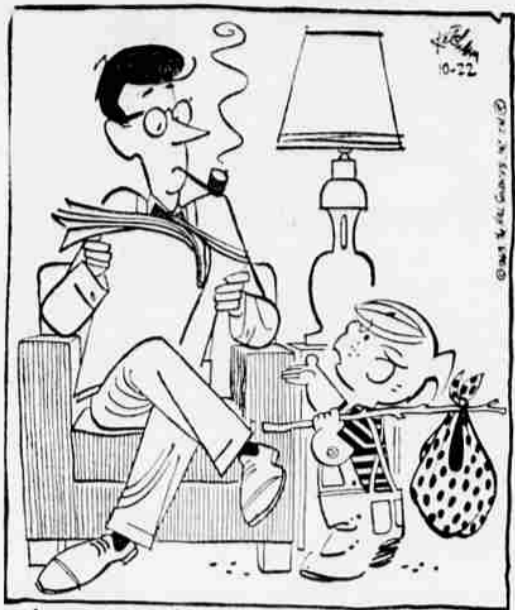
"I'll need some 'runnin'-away-from-home' money."