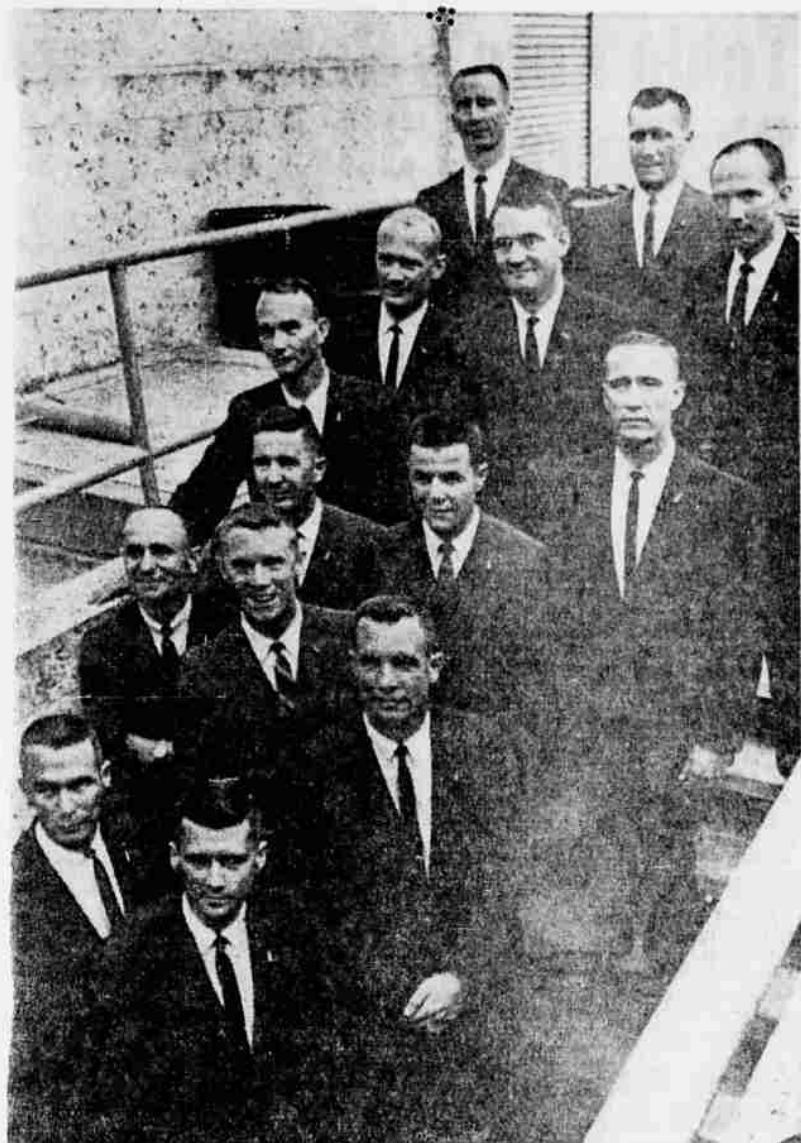
NEW ASTRONAUTS — The 14 new astronauts pose on the steps at Cullen Auditorium at the University of Houston. From left, top to bottom, they are H. Walter Cunningham, Richard F. Gordon, Edwin E. Aldrin, Clifton C. Williams Jr., Theodore C. Freeman, Michael Collins, Don F. Eisele, William A. Anders, Charles A. Bassett II, Alan C. Bean, Russell L. Schweickart, David H. Scott and Eugene A. Cernan.