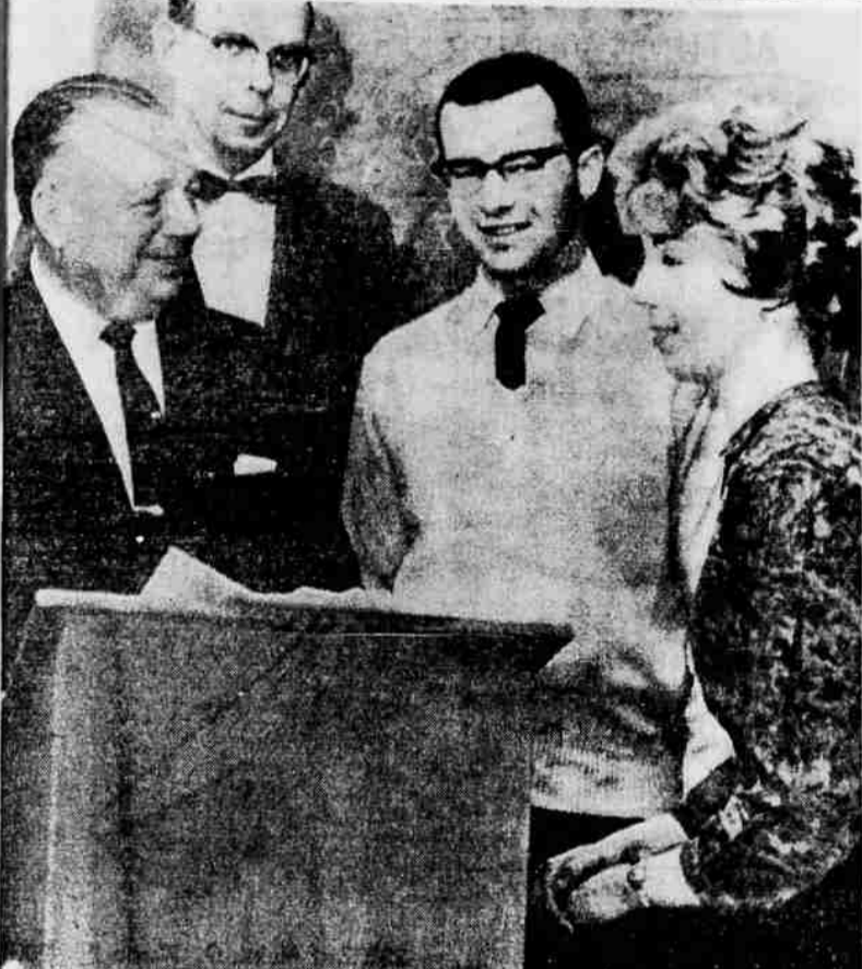
TALKS TO STUDENTS—Michael V. DiSalle, former Ohio governor (L), is shown here talking to members of faculty and graduate students at University of Massachusetts, where DiSalle was professor of practical politics.

DiSalle had pushed through a tax hike of nearly $300 million at the start of his single term in 1959. He said Rhodes had criticized him "for hiring too many people and having too big a state payroll." "Well," DiSalle added today,