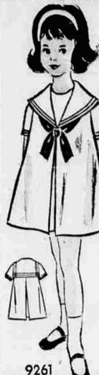
9261 SIZES 2-8 by Marianne Martin

Cheers for the red, white and blue—perfect color team for this sailor skimmer. No waistline shape looks wonderful on little figures. Easy-sew too, in poplin, blends.