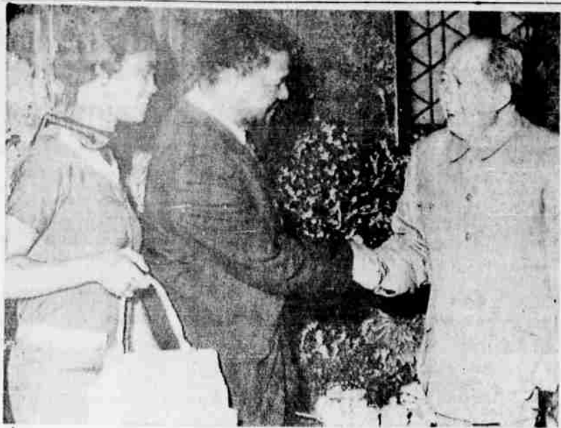
RED CHINESE GREETING — Mao Tse-tung, chairman of the Central Committee of the Chinese Communist Party, greets U.S. Negro Robert Williams and Mrs. Williams as they arrive at a reception in Peking. Williams was on the reviewing stand during a parade in which paraders carried placards and shouted "workers and oppressed peoples and nations unite" —

stand four square behind the American Negro in the struggle against racial discrimination." Williams, an American who works as a propagandist for the Castro regime in Cuba, fled to Cuba in 1961 to escape prosecution in the kidnapping of a white man and wife during racial riots in Monroe, S.C.