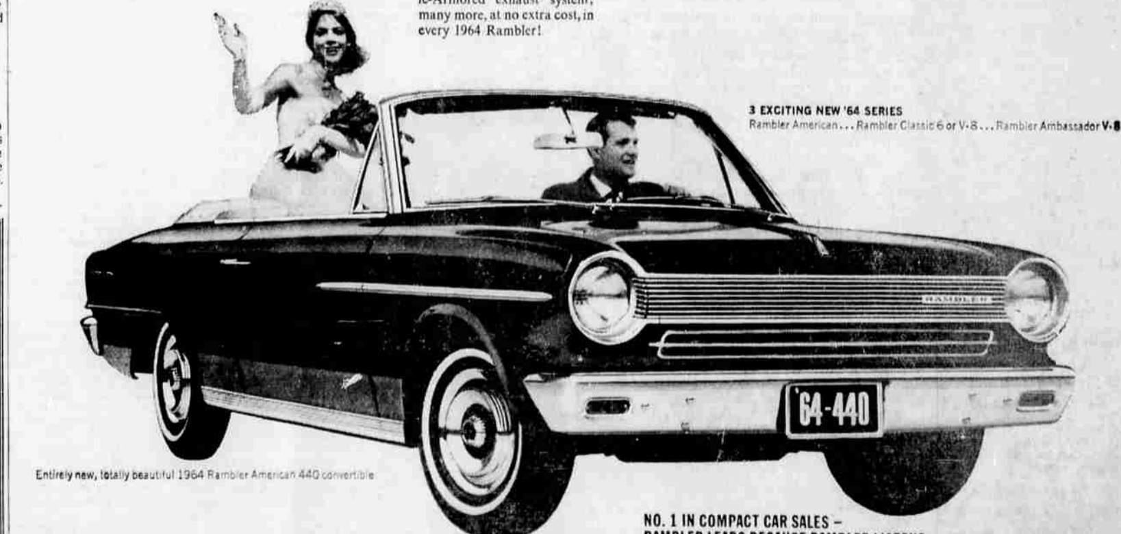
Entirely new, totally beautiful 1964 Rambler American 440 convertible

3 EXCITING NEW '64 SERIES Rambler American . . . Rambler Classic 6 or V-8 . . . Rambler Ambassador V-8