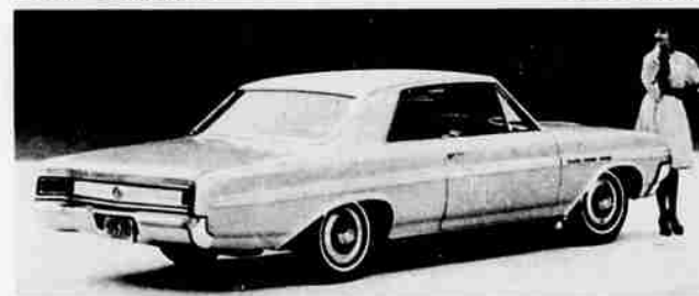
Buick Skylark ▼

three-speed transmission on its Galaxie, replacing the two-speed transmission of last year—and thus beefing up performance. Buick has a 360-horsepower motor, up 35 from last year's biggest. Corvair has gone from 80 to 95 horsepower.