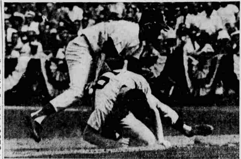
KUBEK PUT OUT — New York Yankees shortstop Tony Kubek is run down and thrown out by Los Angeles Dodgers second baseman Dick Tracewski in third inning Saturday in third game of baseball World Series at Los Angeles.