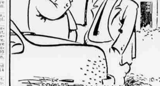
"The best used cars are found right here in the Classified Want Ads—where we dealers get ours!"

FOR RENT or Sale, Ranch type 3-bdrm. comb. living-dining area, carpet. 70' x 35' front. Country living close in. Oak Grove Dist. $9500. 10% down. Call 889 per mo. or will rent $80 if not over 3 children. 772-2436 FOR SALE 3.40 acres. 3-bdrm. house. Double garage. 10' x 40' trailer as part trade. 664-1889. 2-bdrm. home. 2 acres. free irrigation. plus outbuilding. City water & sewer. Good shade trees around home. 2-bdrm. home & guest house nestled in among Oak & Laurel trees. Double garage. 10' x 40' very good barn. All on 3 acres plus with city water. This is view property.