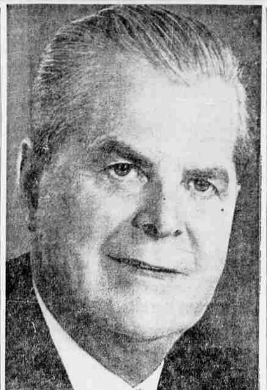
PERSONAL VICTORY - Social Credit Premier W.A.C. Bennett, 63, won a personal victory in his South-Okanagan riding in British Columbia's general election and led his party back into power with a majority.

MANNA WASHINGTON - The Internal Revenue says computers will save taxpayers an estimated $50 million in refunds annually. Refund checks totaling approximately $1.5 billion never reach the taxpayer because the post office can't find them.