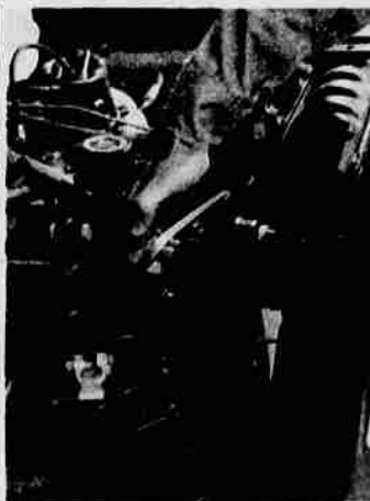
4. Checks fan belt for proper tension and condition.