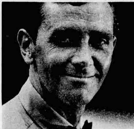
HERE'S WHAT YOUR ATLAS SERVICE STATION DEALER DOES: