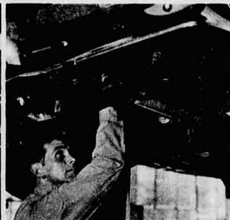
2. Drains and flushes out the entire cooling system (both radiator and engine block).