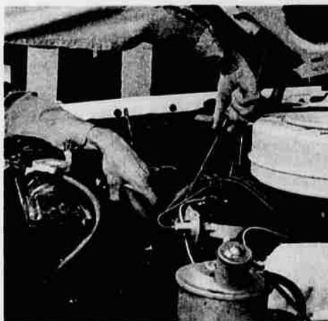
3. Inspects radiator, hose, clamps, pressure cap, and checks thermostat. Checks heater control valve and heater output.