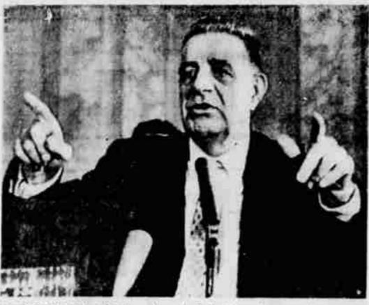
BROKE BLOOD OATH — Joseph Valachi gestures as he appears before the Senate Investigations subcommittee in public session Friday. Valachi broke his underworld blood oath to put the finger on his former bosses in the Cosa Nostra crime empire.

TILLAMOOK — Williamette Valley Lumber Co. has agreed to pay Tillamook county $324,000 in damages as a result of a dam collapse on the Nestucca River last November. The company's Meadow Lake Dam at the head of the river burst Nov. 20, sending a wall of water down the stream.