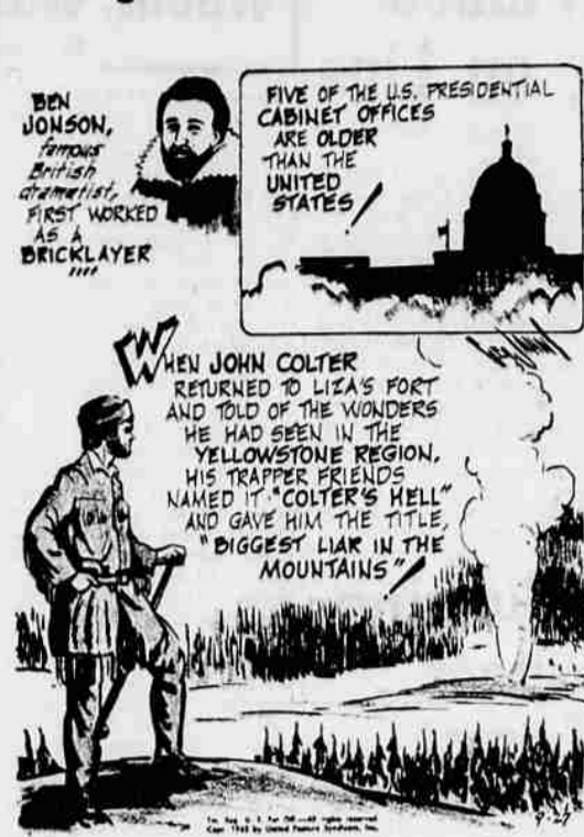
WHEN JOHN COLTER RETURNED TO LISA'S FORT AND TOLD OF THE WONDERS HE HAD SEEN IN THE YELLOWSTONE REGION, HIS TRAPPER FRIENDS NAMED IT "COLTER'S HELL" AND GAVE HIM THE TITLE "BIGGEST LIAR IN THE MOUNTAINS"