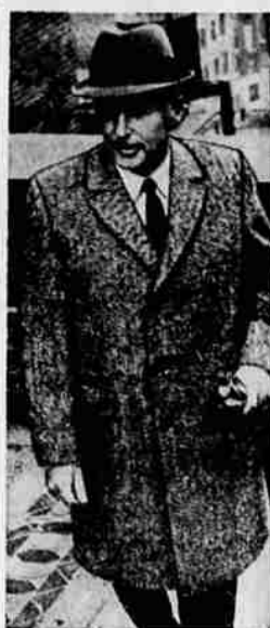
HERRINGBONE — Class styling with attention to details characterizes this herringbone topcoat in a textured black and white British woolen fabric. Cuff sleeves.

swept back to present a graceful, flowing line from toeline to topline. Also very much in the masculine fashion picture is the "crescent," sloping at sides and front, bringing its own brand of refinement to the modified brogue. Color-wise, the leather brogue remains conservative. Black and cordovan are top favorites. Higher Toplines The conventional leather oxford and slip-on are seen around town and country sporting higher toelines and, in some cases, brogue-inspired detailing. Surface treatments vary, and include smooth, cordovan, fine grained and heavy grained leathers. The leather half-boot has become as familiar an element on the winter scene as snow. This year, not only are rugged grained and brushed leather chukkas much in evidence for casual wear, but dress versions in smooth leather are becoming increasingly popular.