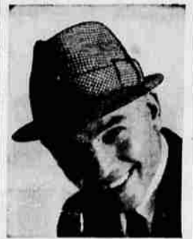
POPULAR — The increasingly popular casual hat is exemplified here in imported Pebbles of Scotland houndstooth wool check; self-band.

GRANT AWARDED WASHINGTON (UPI) — The Public Health Service has given a $77,359 grant to the Oregon Department of Health, Sen. Maurice Neuberger (D-Ore.) said Tuesday. The money will be used for the state's vaccination assistance program.