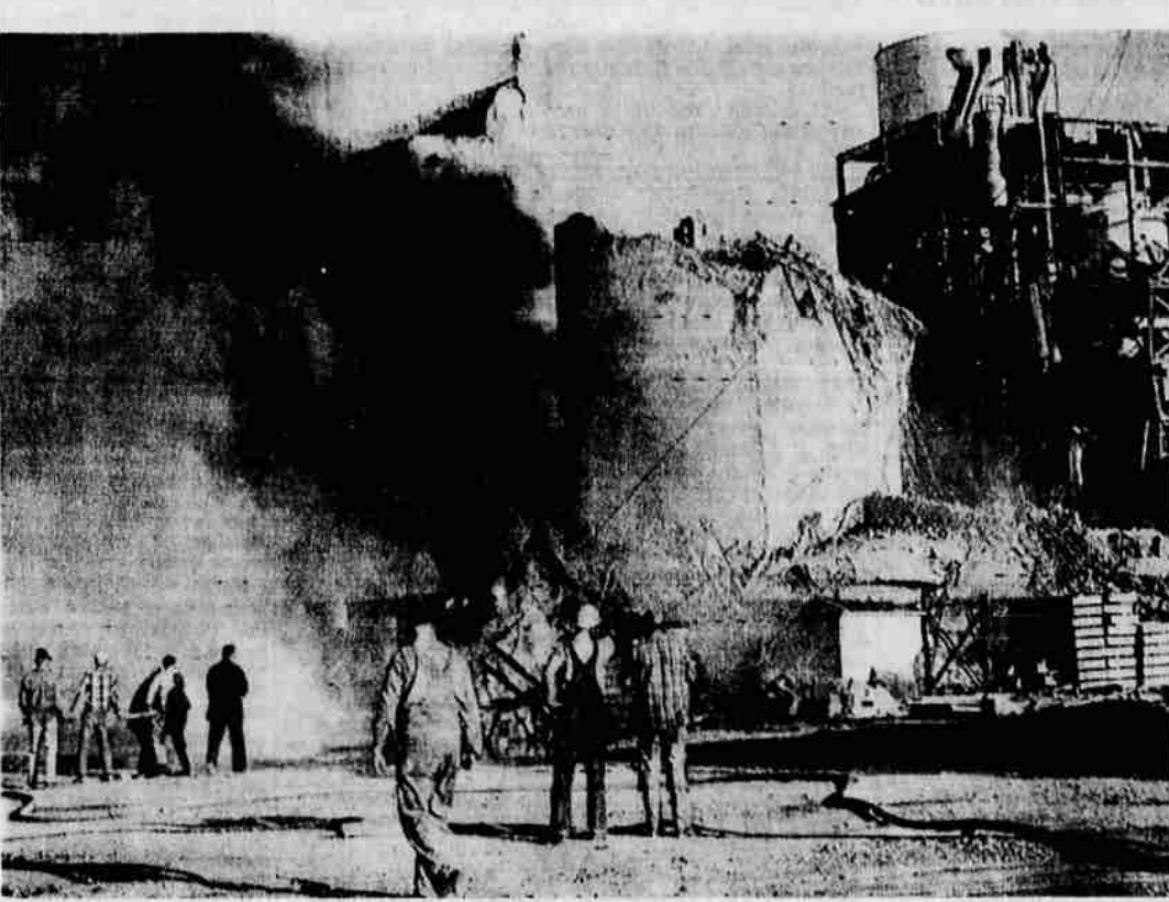
REFINERY DAMAGED — Four people were reported killed when the U and I Sugar refinery at Moses Lake, Wash., was severely damaged by an explosion and fire Wednesday. Four of the eight silos at the plant were destroyed by the blast, of unknown origin.

Major Victory House approval was a major victory for the President and Treasury Secretary Douglas Dillon. Kennedy said in Billings, Mont., that the action was a step toward saving the nation from limping from recession to recession. Dillon said in a statement here that the measure would help encourage the growth of the free enterprise system.